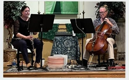
Bel Canto Duo