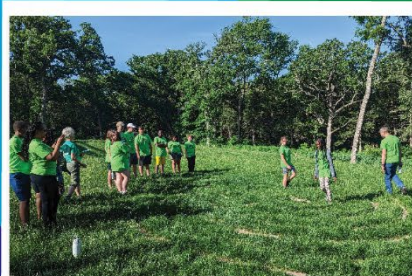
Round & Round Our youth tested out the new labyrinth at Camp Fontanelle