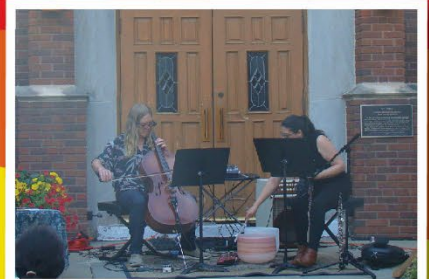
Magical Musical Treat Bel Canto Duo Concert - June 24 Don't miss their next show: Friday, July 28