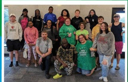
Hard-workin' Crew The trip to Camp Fontanelle was a lot of work and a lot of fun!